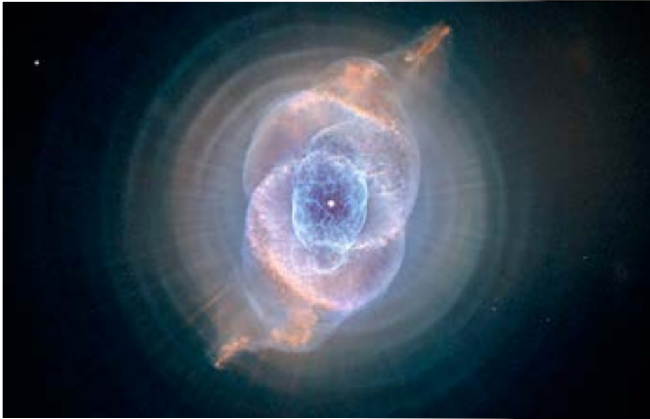
The Cat's Eye Nebula from Hubble APOD November 9, 2014