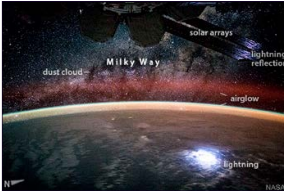
Space Station Vista: Planet and Galaxy APOD January 18 2017, Image Credit: NASA, JSC, ESRS